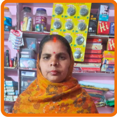
Gudiya, Ayodhya, Uttar Pradesh