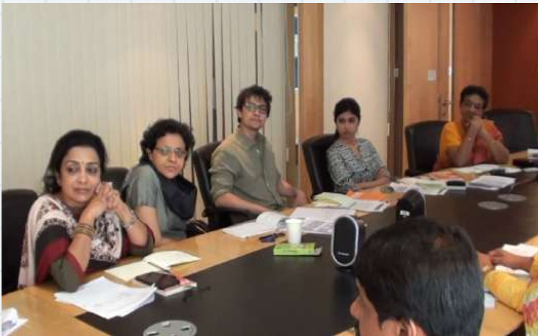
Naandi Foundation Focus Group Discussion (FGD)

In February 2015, Naandi Foundation invited us to conduct a workshop as part of planning for a nation-wide survey of adolescent girls. The Naandi team experimented with FGD questions and tested it with three representative groups. Feedback through video films of these FGDs offered powerful moments of learning. Participants differentiated between research and activism or facilitation, which came to them more very naturally.