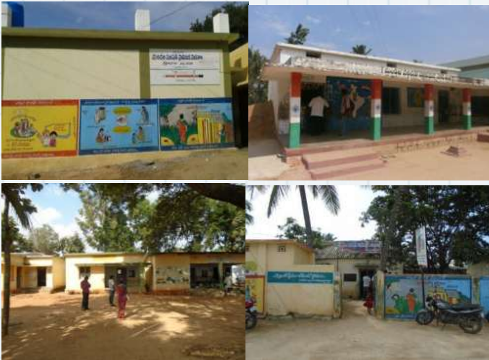
A few of the cluster ready schools identified by Plustrust.