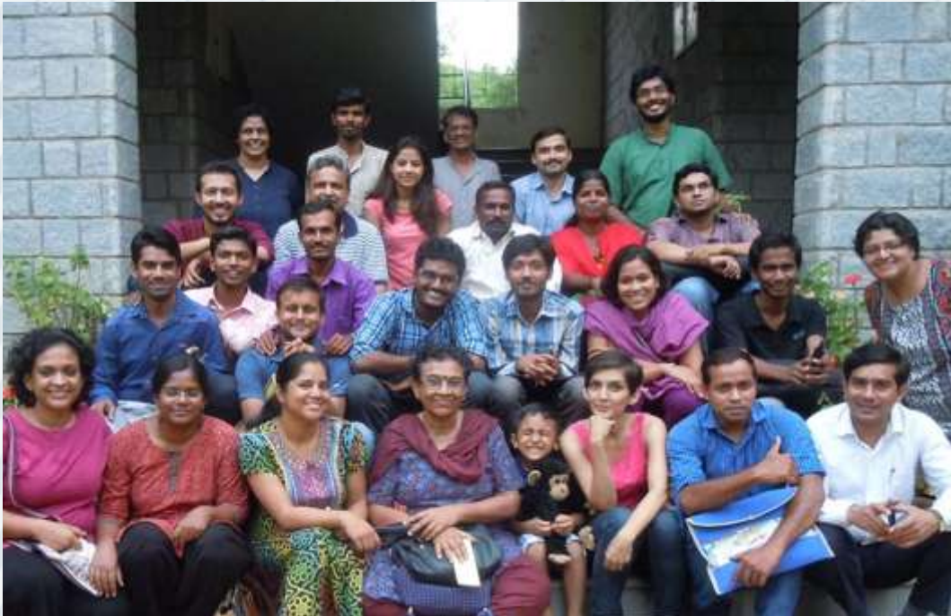
Young energetic participants & organizers, Plustrust Retreat 2015