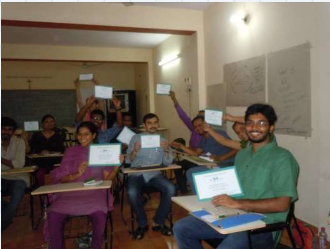
A four day Retreat for current and prospective fellows, May 2015