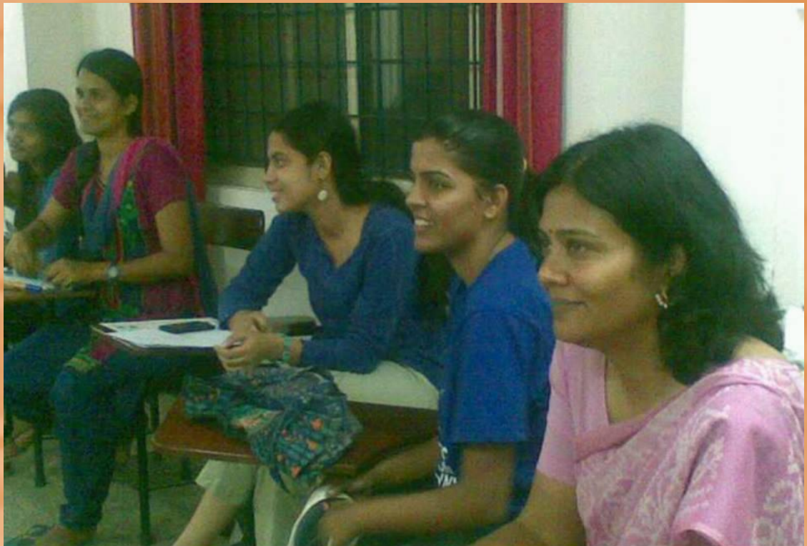
Plustrust Retreat for past and future fellows