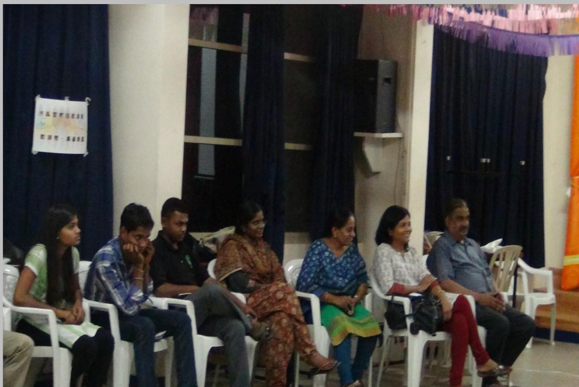
Screening of 'Our School Our Future'