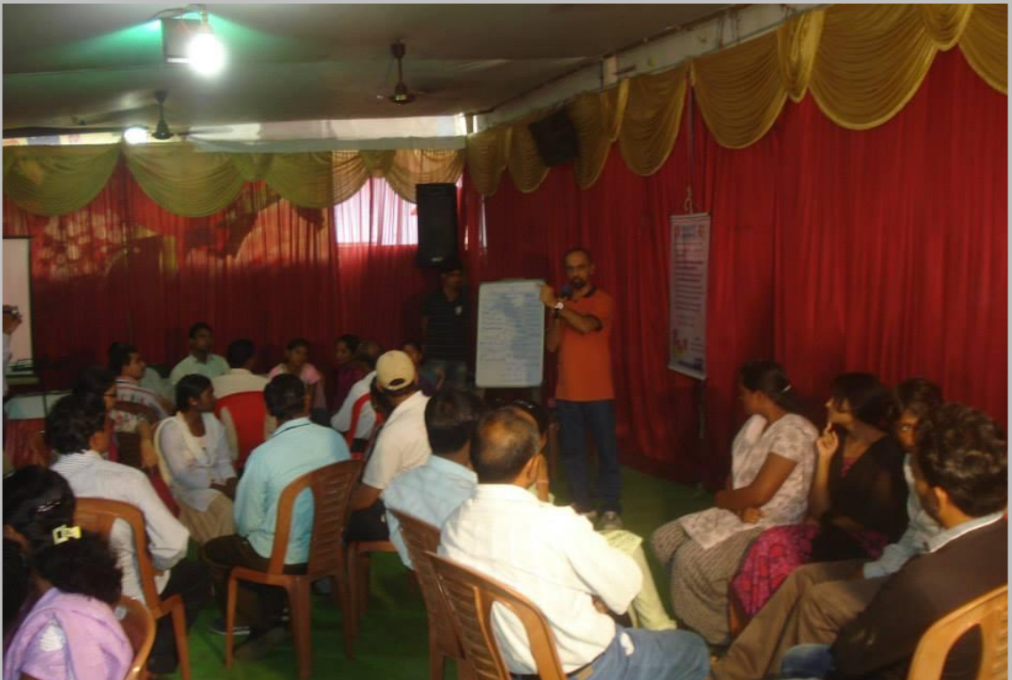
'Jeevan Utsav' at Itarsi MP