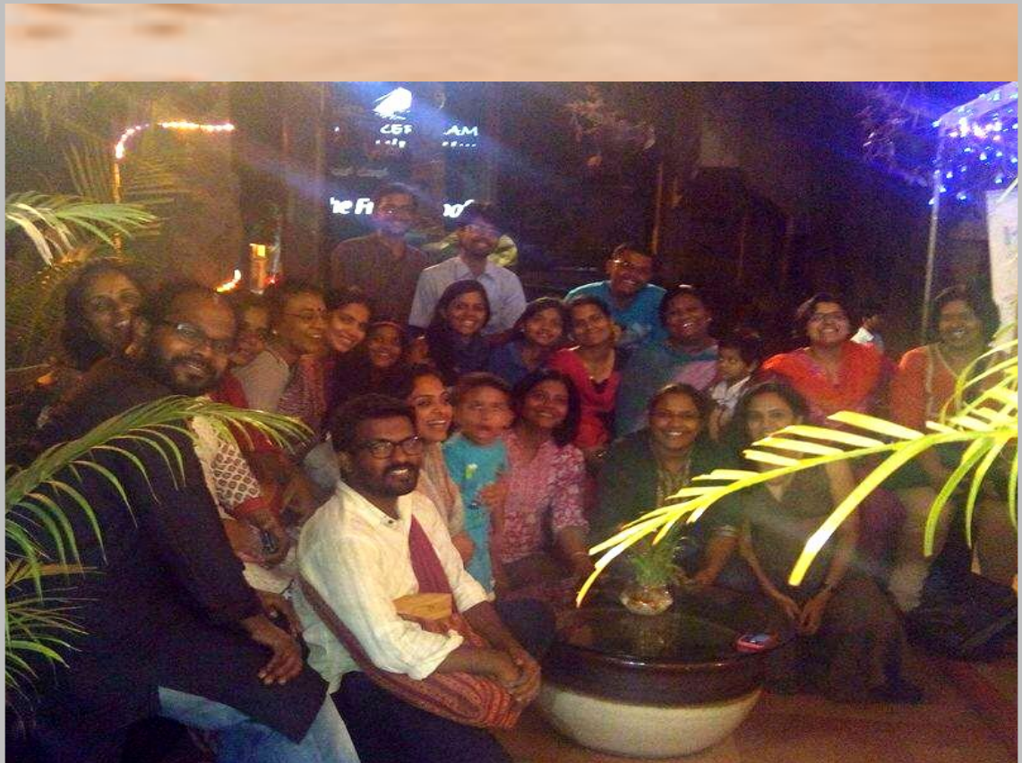
Plustrust Retreat for past and future fellows