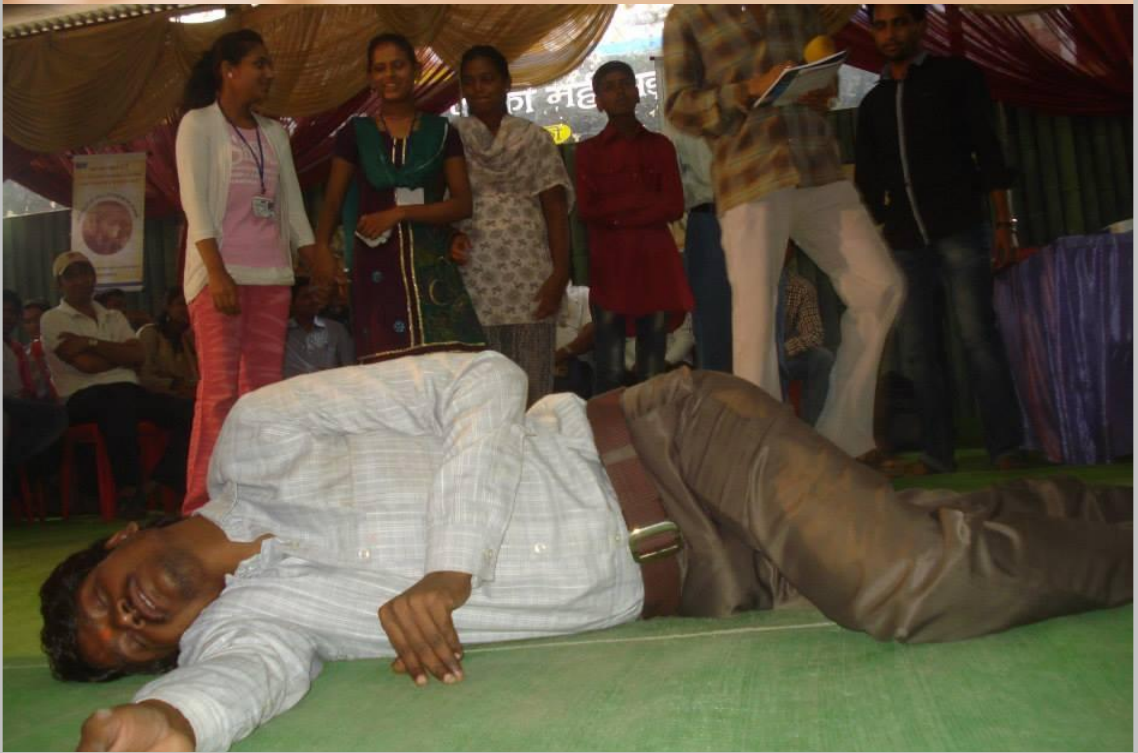
'Jeevan Utsav' at Itarsi MP