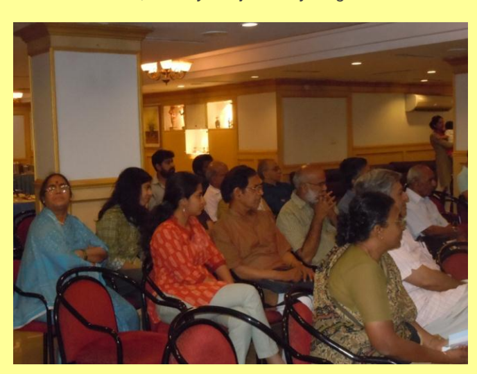
Some of the guests