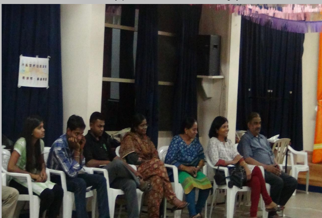
Screening of 'Our School Our Future'